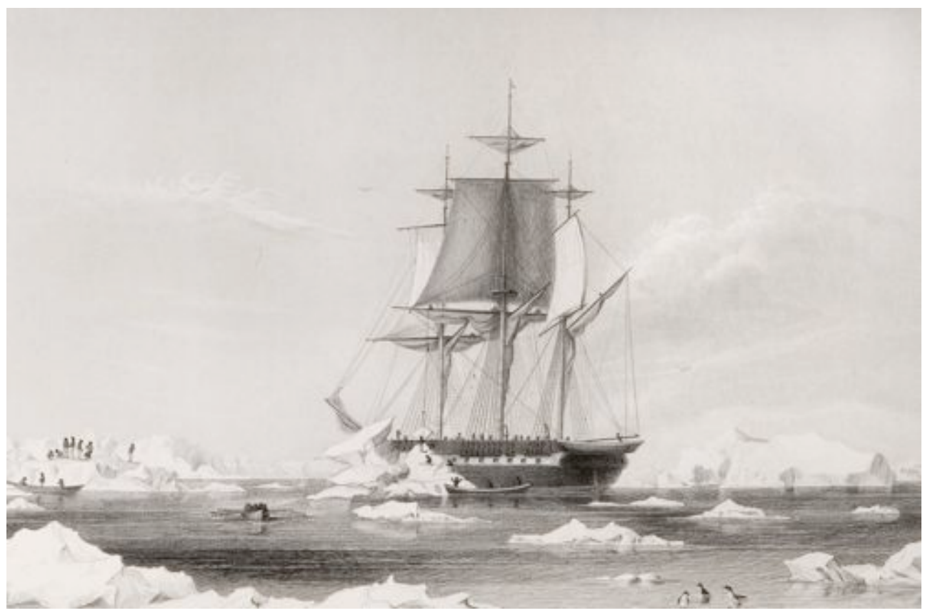
American Exploring Expedition in the Antarctic

During its four year journey, the Exploring Expedition made a number of important contributions.